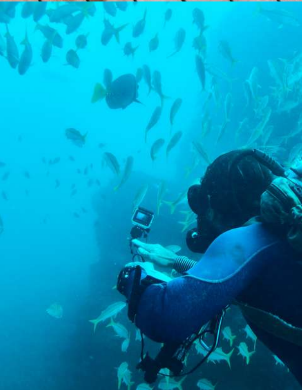
PHOTO AND VIDEO RENTAL

Rent a GoPro to capture the treasured moments underwater. Capture amazing footage and photos of the beautiful marine life in stunning high definition.